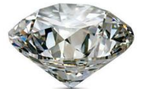
April Birthstone Diamond