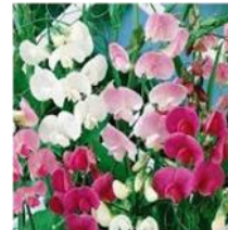
April Birth Flower Sweet Pea

The 2020 flower sign-up book is in the Narthex for people to designate flowers to the memory of, in honor of, and/or in thanksgiving for their loved ones or for a special occasion. Once services are resumed, please sign up in the Narthex or contact the church office (864) 654-5071, or email htchurch@holytrinityclemsong.org to sign up.