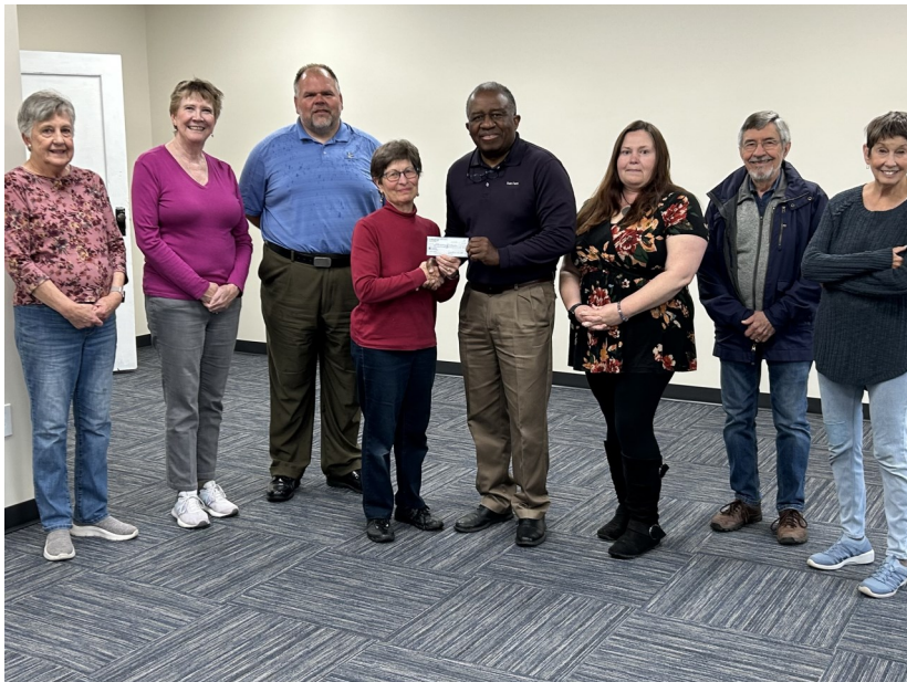
$5,000 donated to Pendleton Community Center for remodeling the kitchen to serve Meals on Wheels.

St. Paul's Thrift Shop's mission, in a nutshell, is to help maintain St. Paul's Church and the thrift shop, and to support the local communities. Come visit, and you'll find an inviting, clean, and friendly shop.