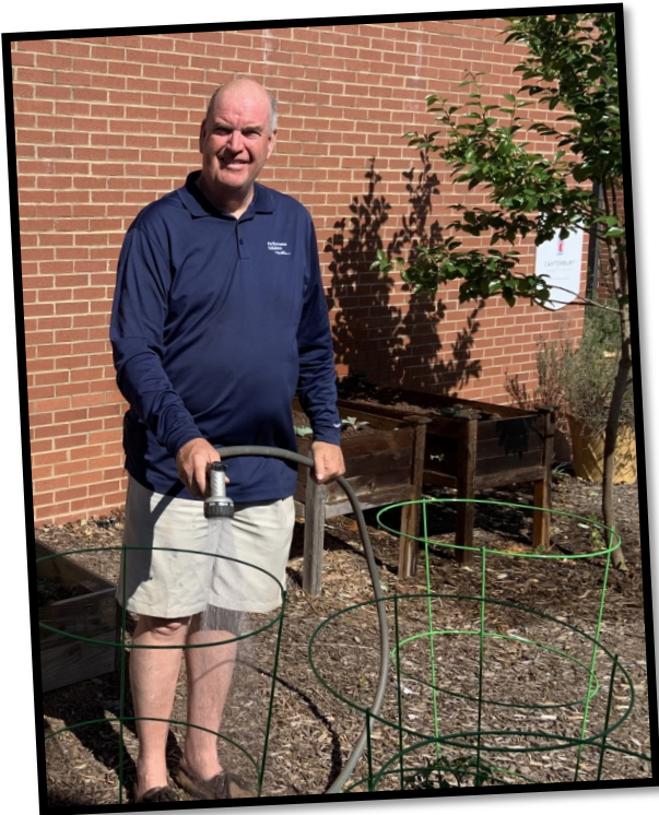
If you water, they will grow!