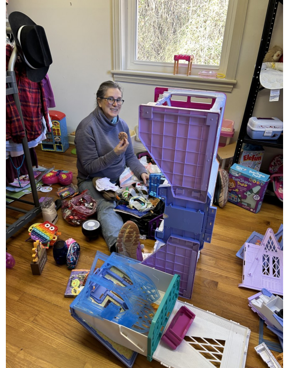
Every Tuesday is price day. Thank you, Tuesday crew.