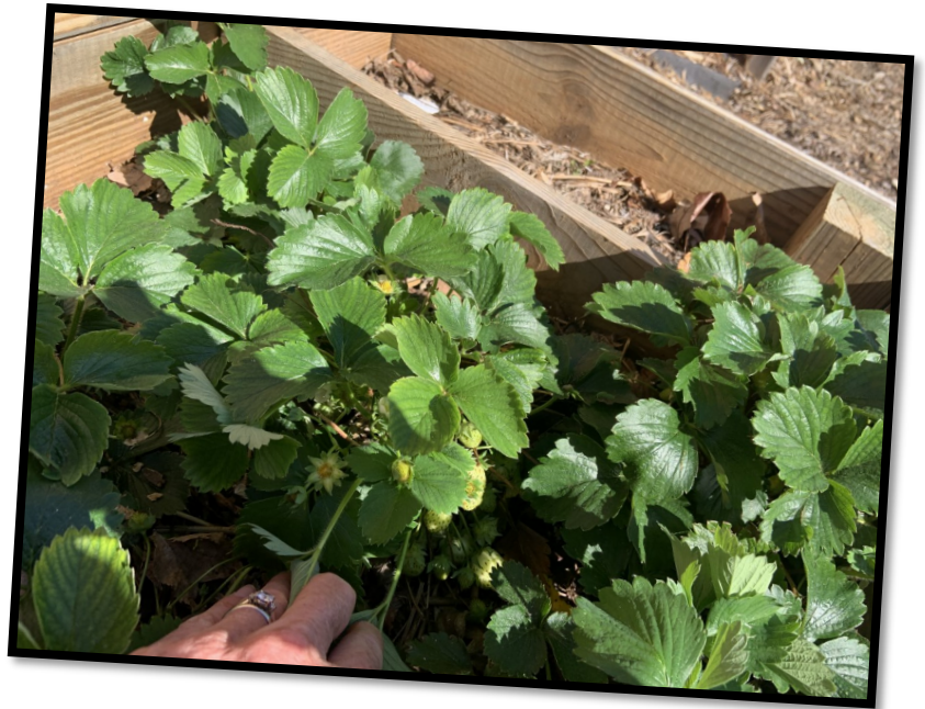
Our strawberry plants are thriving!