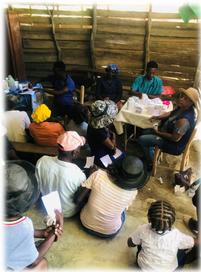
Rural clinic setting.

Our diocese (EDUSC) and parish have been involved in mission work in the Central Plateau of Haiti for over 40 years. Our efforts are focused around public health, education, and agriculture. High blood pressure (hypertension) is a major health problem in Haiti (as it is in the United States) and the African ethnic diaspora has been disproportionately affected. Untreated hypertension can affect both the quantity and quality of life, leading to heart attack, heart failure, stroke, and kidney failure. Treatment is very effective and greatly reduces these risks, but it requires diagnosis and a prescription for one or more medications. Pills then must be taken on a daily basis; certainly a daunting task in a rural, resource-poor setting!