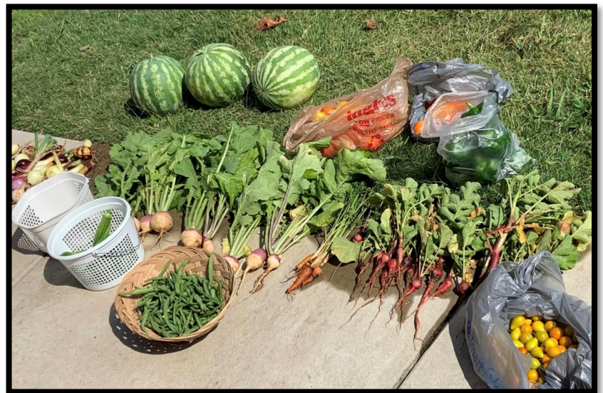
Last year's bounty.